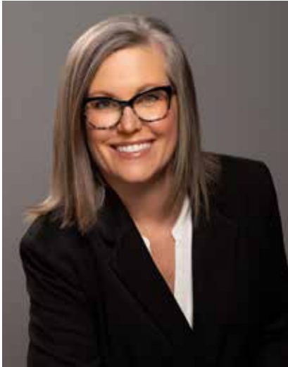
Katie Hobbs Governor of Arizona

“Congratulations to this year’s All-Arizona Academic Team! Today we celebrate your academic achievement and leadership in your community. Arizona is proud of you and can’t wait to see the big things you accomplish in the future.”